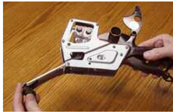
Ready to load

The Towa GL Price Marker is shown in the photos below. These instructions also apply to the Models GS and GH as well.