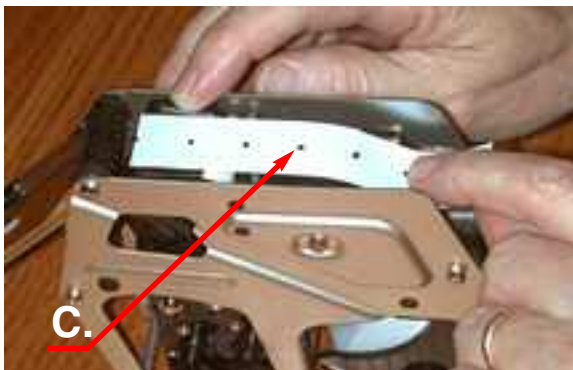
Fold labels back over and align holes in the labels with pins on the sprocket C.