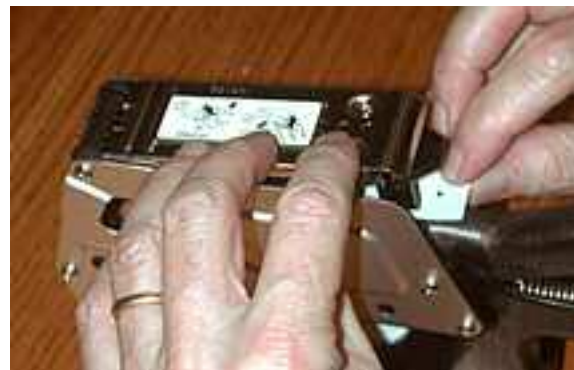
Close the bottom cover. (Label waste is dispensed between the handles.) Your price-marker is now loaded and ready for action!