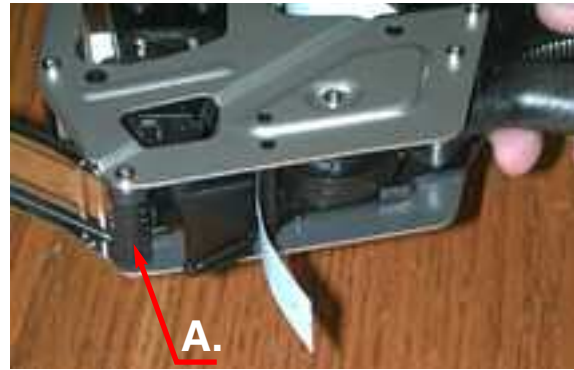
Note: When threading the labels do not pass them through the roller A.