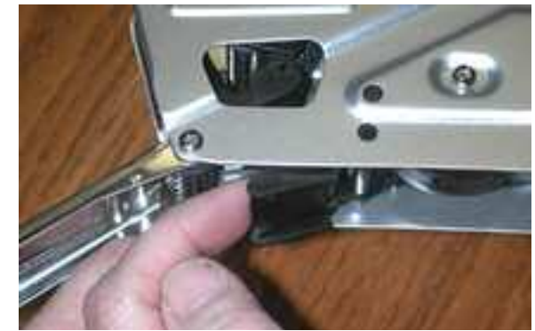
Pull down on the forward part of the printbase. This will open the path for the labels to pass through